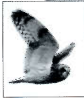
Short-eared Owl at Illinois Beach State Park. 5 October 2002.