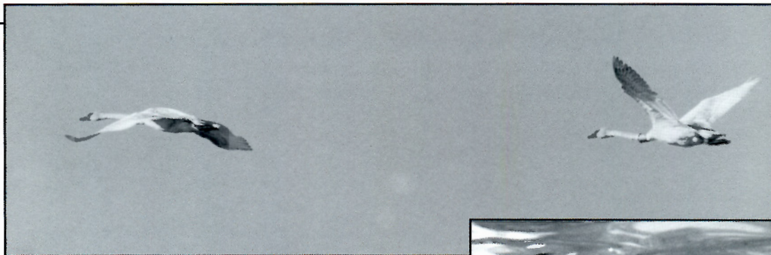
Trumpeter Swan, Lake Springfield, first Sangamon County record, 25 Nov. 1994. Note band on neck of one of the swans.