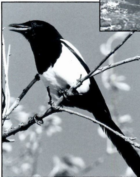
Black-billed Magpie, one of two probable escapees from a local breeder. McHenry County, 19 Oct. 1994.