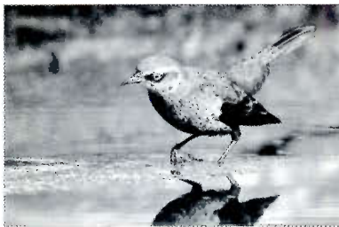
Rusty Blackbird. Heron County Park, Vermilion County. 2 October 2010.

MC: 5, Perry , 3 Aug (MSS). LD: 26 Oct, Sang , (HDB); 2 Oct, CarlL-C (DMK); 17 Sep, Richland (MSS, CLH).