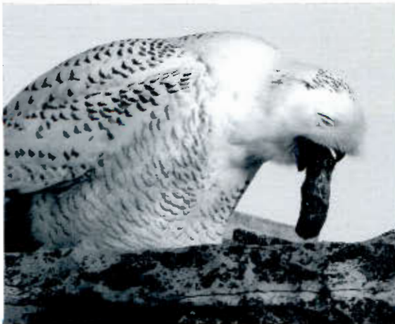
Snowy Owl coughing up pellet. Montrose Point, Lincoln Park, Chicago, Cook County. 11 December 2012.