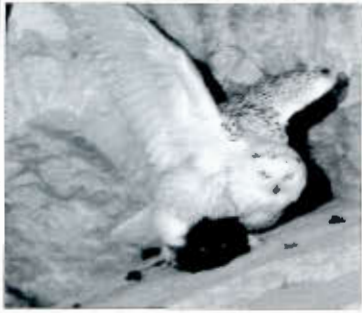
Snowy Owl eating freshly caught American Coot on rocky jetty at Winthrop Harbor, Zion, Lake County. 2 December 2011.

Snowy Owls ( Bubo scandiacus ) staged a record irruption during the winter of 2011-2012. With Snowy Owls seen throughout the state, several people were able to procure regurgitated pellets. Pellets consist of undigested parts of a bird's prey, often comprising fur, feathers, exoskeletons and bones. Pellet contents have long been used to assess the diets of owls, which due to their nocturnal habits can be very difficult to do through observations (e.g. Cahn and Kemp 1930).