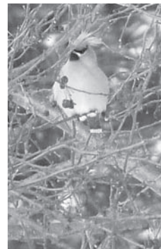
Bohemian Waxwing. North Point Marina. Lake County. 2 February 2013.