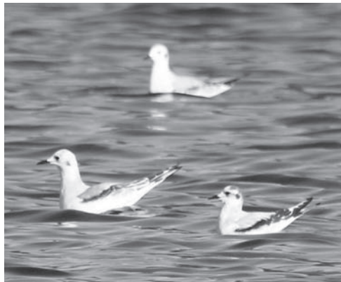
Little Gull with two Bonaparte's Gulls. Carlyle Lake. Clinton County. 9 November 2013.