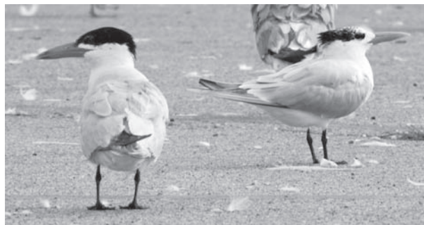
Royal Tern, right. Carlyle Lake. Clinton County. 10 August 2013.