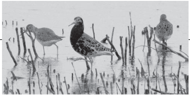
Ruff. Whiteside County. 3 May 2013.