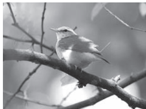
Swainson's Warbler. Quincy. Adams County. 18 May 2013.