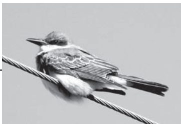
Gray Kingbird. Edwards County. 1 November 2013. Illinois' second confirmed record.