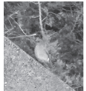
Mountain Bluebird. Lost Mound National Wildlife Refuge. JoDavies County. 23 February 2013.