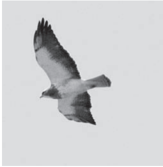
Swainson's Hawk. Marion. Williamson County. 20 April 2013.

In addition, any species not listed in the checklist of Illinois state birds